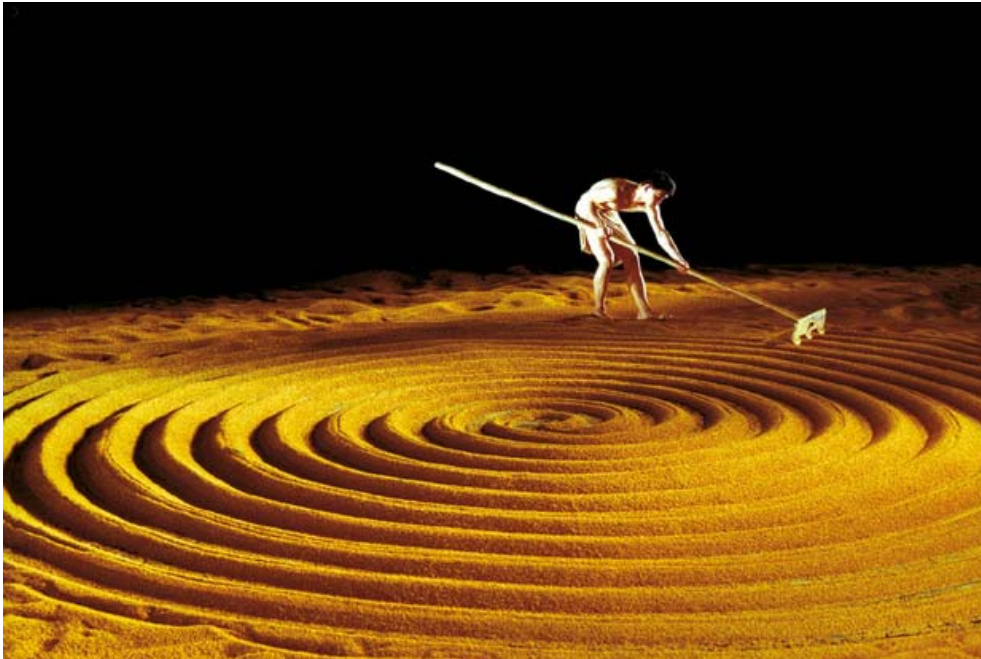
The Cloud Gate Dance Theater explores spirituality and dance with three and a half tons of rice. ( Cloud Gate Dance Theater of Taiwan )

By Jamie Hale | The Oregonian/OregonLive